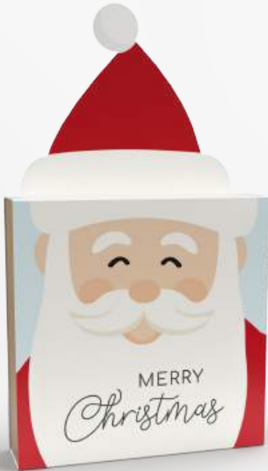
SANTA HAT PAGE 237