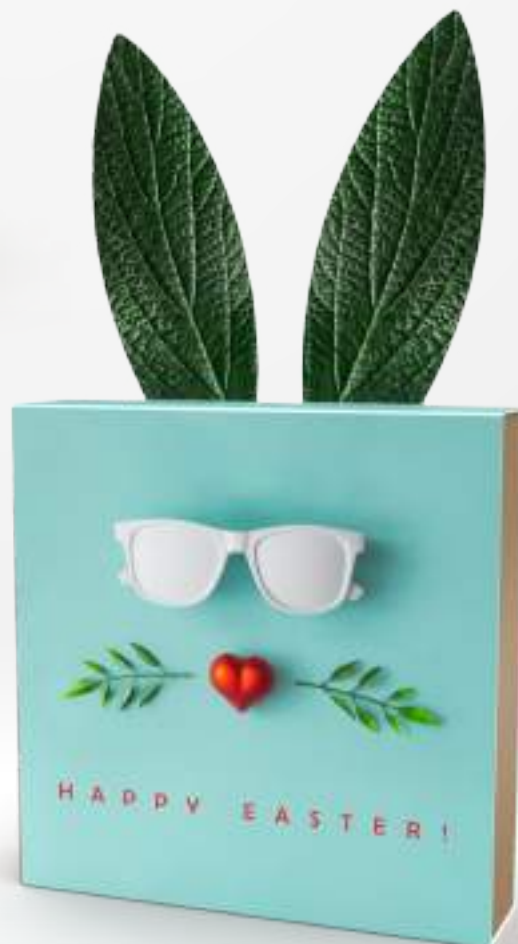
EASTER BUNNY EARS PAGE 172