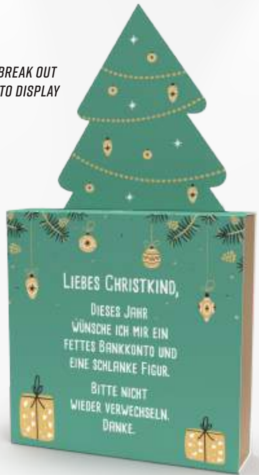
CHRISTMAS TREE PAGE 236

ELEMENT ON THE BACK TO BREAK OUT AND FOLD UP TO DISPLAY