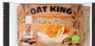
Milk & Honey